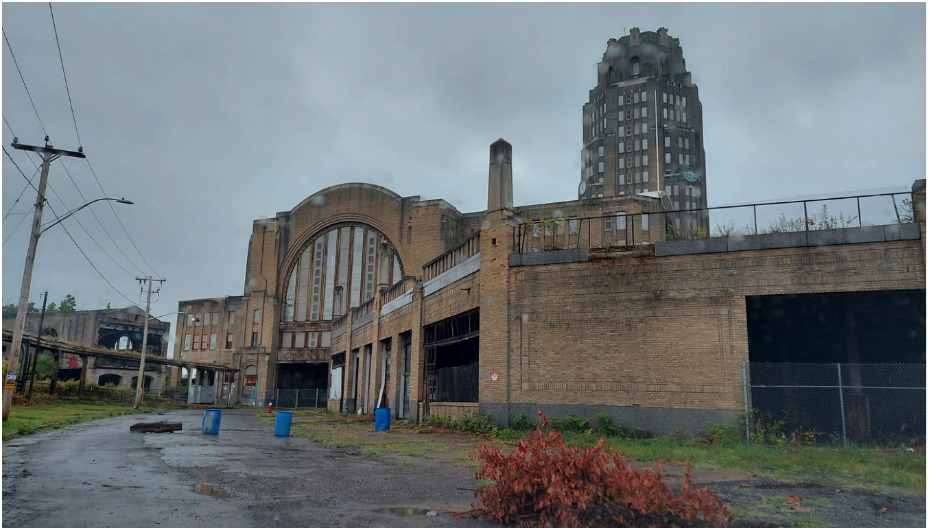
Back Side of the Terminal, Notice some of the decay.

a very beautiful building with many art-deco architectural elements, though difficult to do more than sneak a peek from far away for a few seconds. One of the reasons we did not stick around too long, besides it being in the ghetto, was this homeless man that was flagging down traffic and nearly causing multiple accidents. Something we did not want to be near or a part of. After snapping some pictures of the front and one of the back, we decided to hurry out of that area to safer downtown Buffalo. There is a restoration project