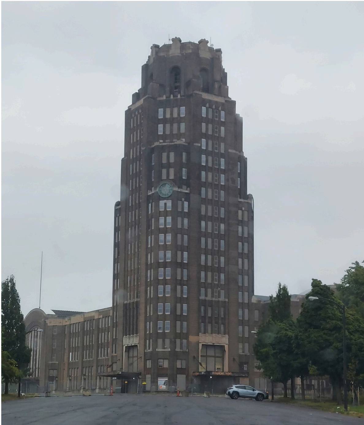
Photo of the Front from the Start of the Entrance Ramp.