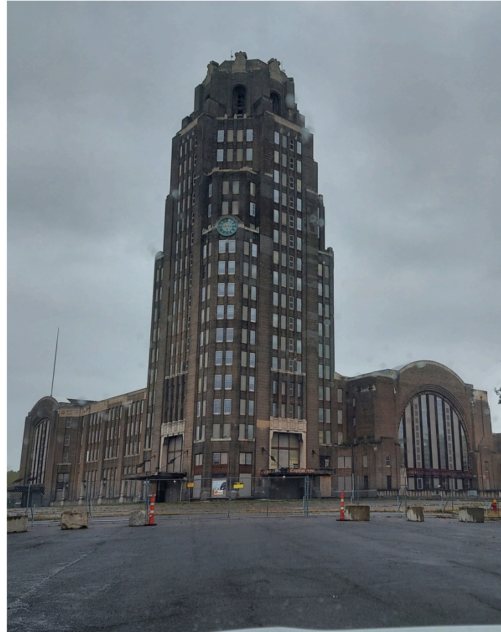
Front Entrance of the Terminal.

Kellie, we decided to stop by and check it out. Sadly, the terminal is only open for special events throughout the year, which meant the best we could do is drive by and take a few pictures. On the way to the terminal, we discovered it was located in the ghetto of Buffalo. Many of the surrounding buildings were in disrepair including ones connected to the terminal tower. The main entrance is off a roundabout, but you can only drive up the ramp so far before it's blocked off. It is