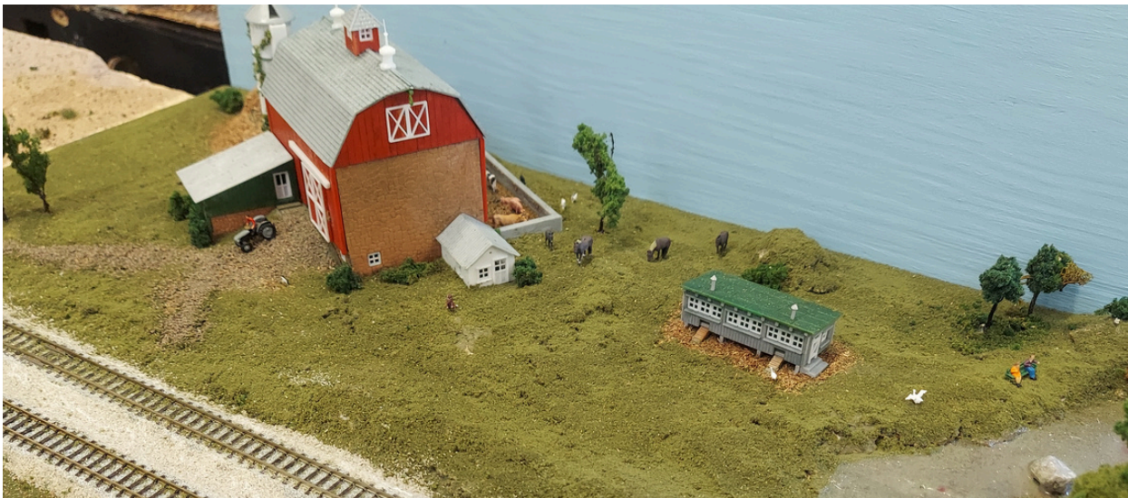
Bonnie L.'s new farm T- Trak Module