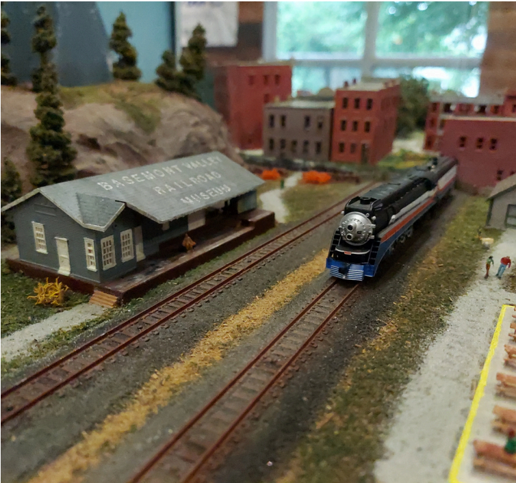
Above: Mike B.'s Freedom train sits static on Lou D.'s module Below: Chuck L.'s mile long BNSF crosses the 4' bridge