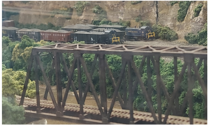
Left: Truck waits for train on Chuck L.'s module. Above: Switcher's working the coal plant on Matt K.'s