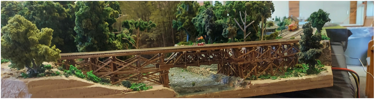
Rich F.'s trestle over a river T-Trak corner module