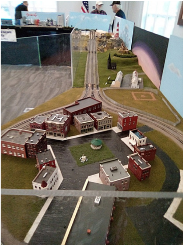
N-Trak Town End Loop (Before Additions)